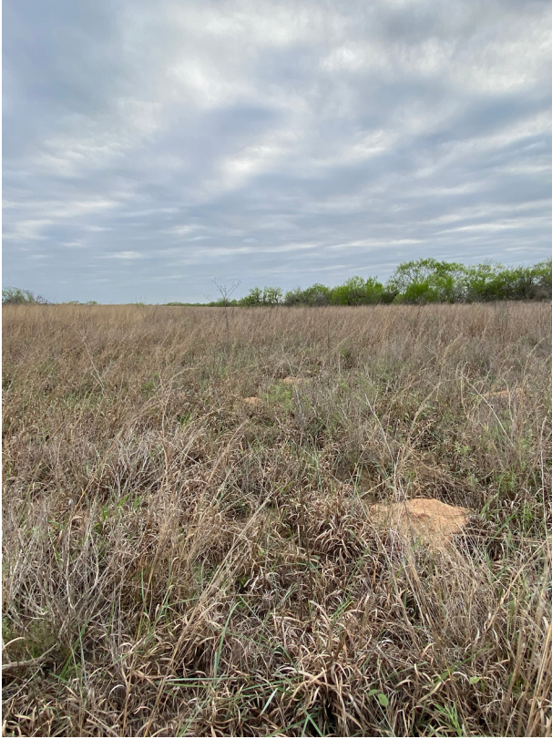
Figure 2: Habitat in which the albino B. taylori was captured on the San Antonio Viejo Ranch, Jim Hogg County, Texas, USA on three separate occasions (16 March 2021, 17 March 2021, and 2 April 2021).

abundance, allowing mice with deleterious traits to persist longer than they normally would. Regardless, albinism in B. taylori must be rare, as this animal represents a first among 3942 Baiomys (approximately 0.025% of sampled individuals) captured on East Foundation properties over a seven-year period.