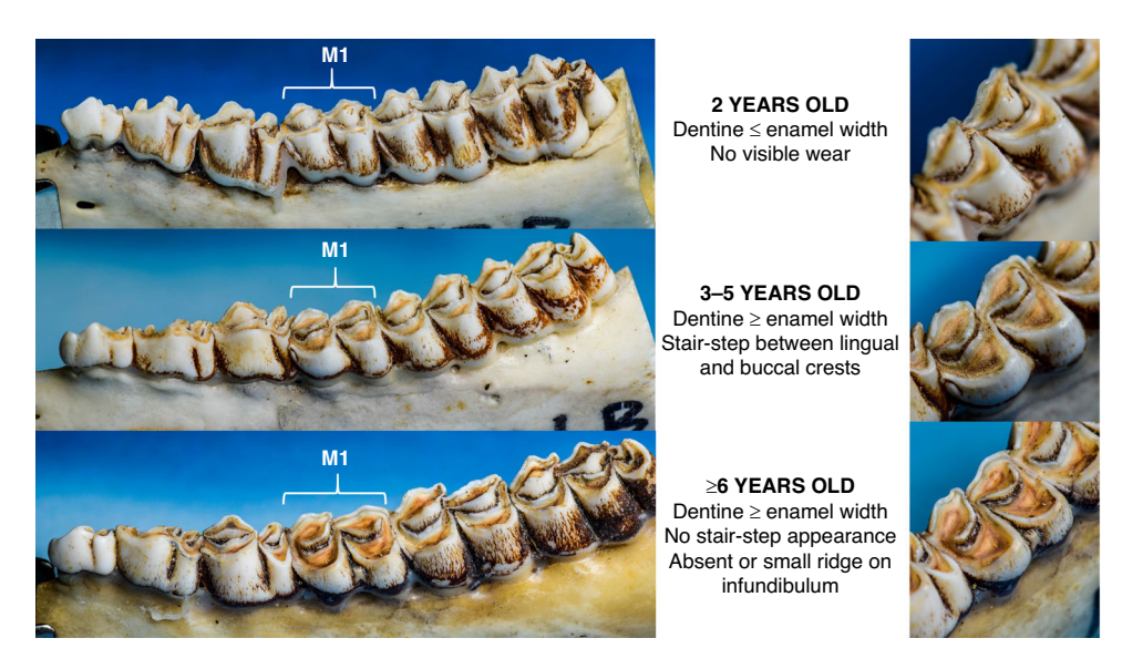
Fig. 3. Ageing guide provided to biologists (n = 20) for evaluation of new ageing method using simplified toothwear criteria for white-tailed deer that pools adults into three age classes: 2, 3–5, and \geq 6 years old.

Despite the many evaluations of TRW and CA methods for estimation of age in ungulates (DeYoung 1989; Hamlin et al. 2000; Gee et al. 2002), there is often little consensus beyond the detection of unmodelled variation in age estimates. In part, the ambiguity is due to limitations in sample size and failure to