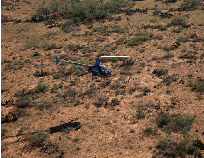
Aerial surveys using a helicopter platform on East Foundation lands.

using multiple observers. However, when using the CDS method, population estimates and standard errors should be increased by 10% to account for imperfect detection on the survey line. In situations, such as scientific applications, in which precise estimates are required landowners should consider using the MRDS method, acknowledging that it is more expensive and has associated complexities and potential biases .