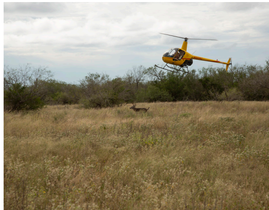
Aerial surveys using a helicopter platform on East Foundation lands.

In 2013, the East Foundation, together with the Caesar Kleberg Wildlife Research Institute at Texas A&M University Kingsville, embarked on a study aimed at determining the effectiveness and feasibility of the MRDS method. Our main purpose was to compare methods and develop large mammal aerial survey recommendations for landowners, ranchers, and wildlife managers in South Texas needing to know – “How many animals are there on my land?”