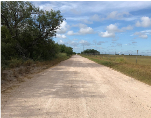
A freshly laid caliche road on Santa Rosa Ranch stretches for over a mile.

The theme for this newsletter is Grit . And while this section may not be an example of "courage and resolve," I will offer up another definition of grit: "small loose particles of stone or sand." And that seemed apropos!