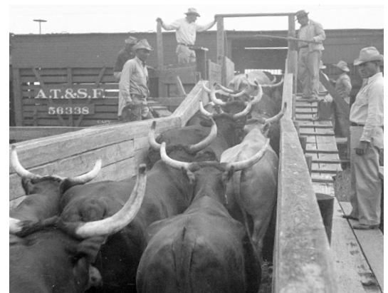
Cattle were shipped by rail from South Texas to stockyards throughout the Midwest.

then among the largest cattle shipping points in the nation. Cattle from ranches throughout South Texas were shipped north from Hebbronville eventually arriving at the slaughterhouses and packing plants in the Midwest. Cattle for feeding troops were shipped north to meat packers in Chicago, Kansas City, and Green Bay. By 1918, the stockyards in Kansas City were handling more than 55,000 head of cattle per day, while meat plants in Chicago were processing more than 1.5 million pounds of beef weekly. By the end of the war, U.S. troops had consumed an estimated 800 million pounds of beef.