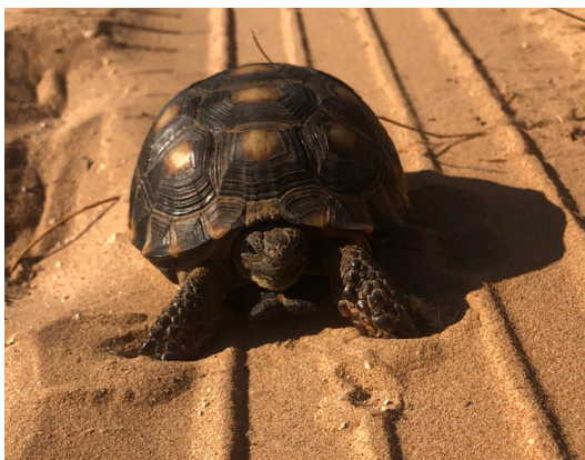
Don't Tread on Me!

Now that's probably not a feasible way to reduce the population, but it has made me think about all of the animals that use the caliche roads besides ranch folk that are in a hurry. Here are a few of the main ones that need to be watched for while traveling our ranch roads.