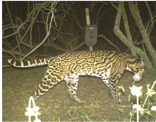
Satisfied ocelot photographed in camera trap on El Sauz Ranch in 2014.

The ocelot population occurring on private ranches is much larger and more robust than the small ocelot population occurring on public lands of the U.S. Fish and Wildlife Service’s Refuge System. In accomplishing this, we have worked closely with nine different graduate students, having graduated three PhD and two MS scientists into professional positions.