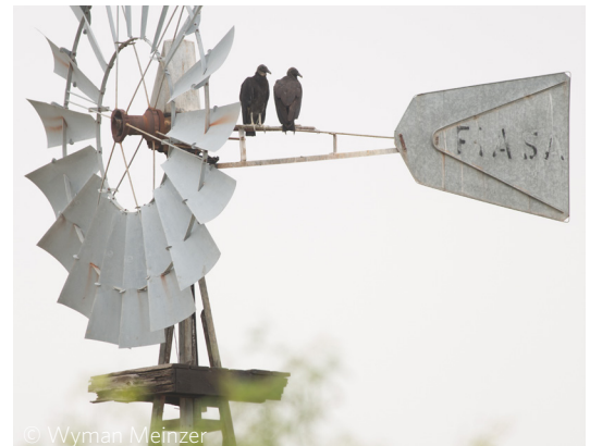
Dotting the landscape of the East Foundation ranches are windmills that provide drinking water for people, livestock, and wildlife. In addition, because many of the windmills have been on the ranches for so long they also have names and serve as landmarks to guide folks in the right direction.

people, livestock, and wildlife alike for decades—some producing in the same location for nearly 100 years. Windmills still provide water to significant portions of our ranches. For years they have been the only option in remote areas of the San Antonio Viejo or Buena Vista ranches where electricity is not available. Until recently, few options were available to replace windmills as it is cost prohibitive to run miles of electric lines for a small number of electric pumps.