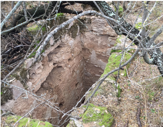
Old hand-dug wells, such as this example at the old Ramirez well, were essential for the community at San Antonio Viejo. Many of these same sites still support productive water wells important for both cattle and wildlife.

have been added over time. But the two original wells remain important water sources for that pasture.