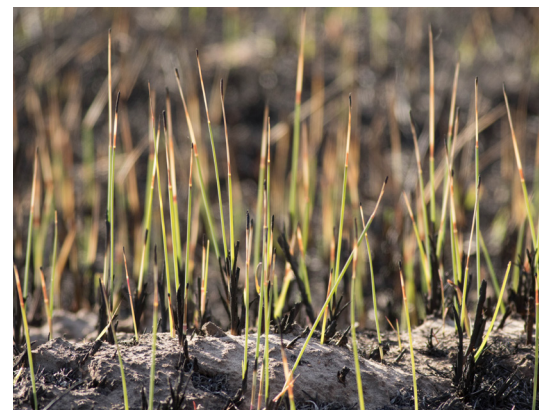
After a burn, new growth provides forage and habitat for wildlife.

In 1903, when addressing a group of farmers, Theodore Roosevelt said, "Far and away the best prize that life has to offer is the chance to work hard at work worth doing." As a land steward it may take a lifetime to fully enjoy the harvest of seeds sown years before, but it is indeed work worth doing.