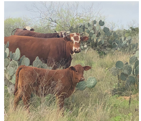
Cattle on the San Antonio Viejo Ranch.

This technology can be used to trace animals in case of needing to discover the source of a disease outbreak. Similarly, the future use might include tracing the identification of a specific piece of meat back to an individual animal from a specific place. And knowing the story behind that animal, and the natural setting from where it came, just might be better than knowing that your piece of meat was cultured from stem cells in a food technology laboratory in Berkeley, California.