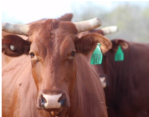
Cattle on the East Foundation Ranches receive an ear tag and an RFID tag.

These initial tests will show if this system could potentially work with our entire cow herd. If it does, it would allow us to track our entire inventory system and all production metrics "chute side" and instantaneously as we work an animal giving us improved accuracy in culling animals, sorting cattle, and providing a fast and efficient and way to update inventories.