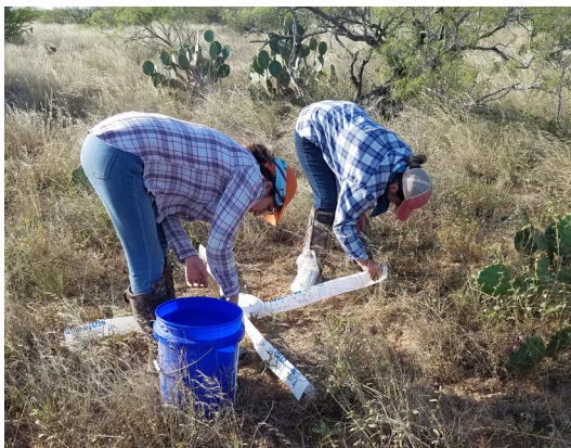
Students set up a pitfall trap to catch arthropods using an X-shaped guidance barrier.