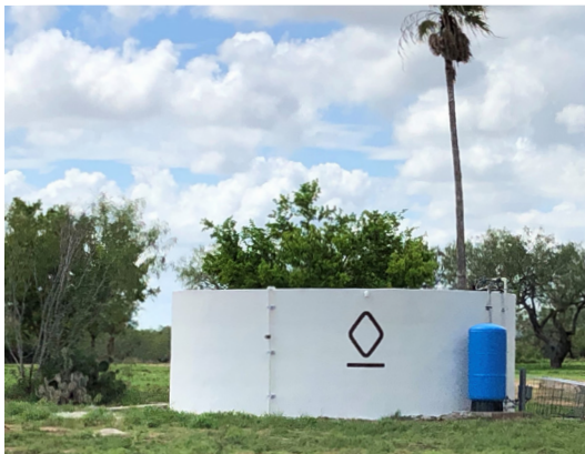
A pila near the East Family House gets resurfaced and a new paint job.

We are still working on maintenance and cleanup projects around the San Antonio Viejo Ranch. Some of the projects include dressing up our cattle guards with new H-braces and gates, resurfacing a pila near the cemetery, trimming trees, etc.