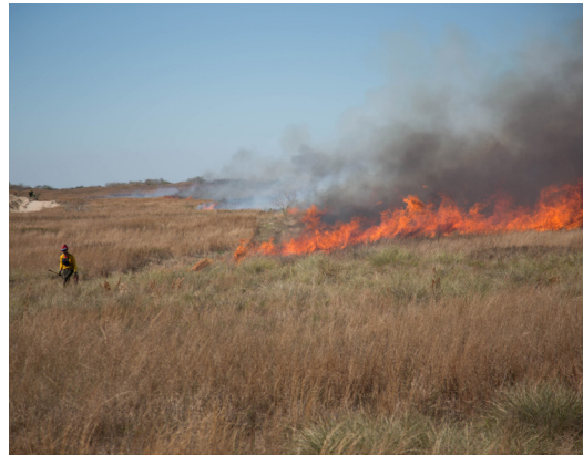
A graduate student initiates a prescribed burn on El Sauz Ranch.

living laboratory that will influence generations to come—again, it's a long game.