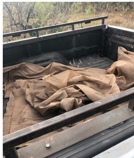
An empty truck bed long abandoned by its many passengers.