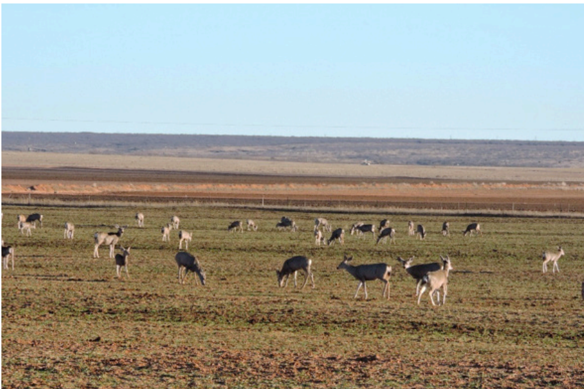
Mule deer crowding a winter wheat field during January 2017.

While mule deer do not exhibit seasonal use of distant areas, there is certainly a seasonal pattern of resource use, if only in a small area. Mule deer aggregate on wheat fields at predictable times of the year. This knowledge will be useful in designing surveys to estimate mule deer density in the Panhandle or similar regions where wheat is present. Accounting for artificially high density during winter surveys in these areas will yield a more accurate density estimate, which will produce more appropriate and sustainable harvest management practices. For example, the deer harvested in November are likely the deer that will be feeding on winter wheat in that same area during winter and early spring. Addressing the case of the disappearing mule deer will help ensure that this treasured resource will be around for many future generations.