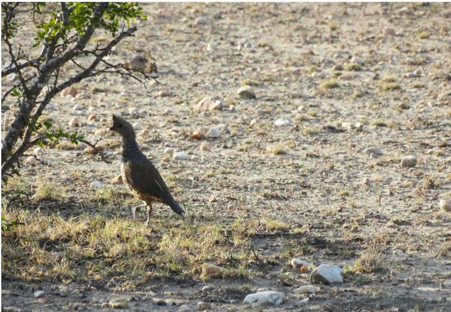
Figure 1. Scaled quail are almost always found within the shade-cast of shrubs in South Texas. These microsites provide lower ground surface and black globe temperatures.

energetic cost for regulating body temperature and critical chemical processes may be hindered within the body when temperatures are outside of this range. When considering sites that scaled quail use for foraging and loafing, both ground surface and black globe temperatures were important, but this importance varied by time of day. During early morning and late afternoon (times of day with cooler temperatures and long shade-casts), selection for sites with cooler microclimates were not as important. However, during the warmest times of the day, late morning and early afternoon, scaled quail sought cooler locations than were randomly available across their habitat. The probability of use of a given site for foraging or loafing decreased about 10% for every 1% increase in ground surface temperature.