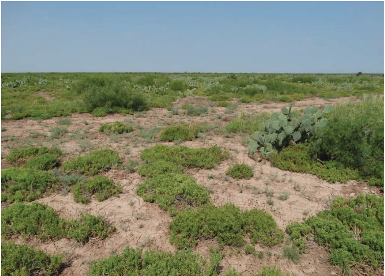
Figure 2. Typical scaled quail habitat on saline soil in South Texas. Note the dark green dense canopied shrub in the top right background of this photo. Although plants like this may represent a small percentage of the landscape, these limited sites provide critical thermal microsites during the hottest summer months. Without them, scaled quail may cease to inhabit otherwise suitable landscapes during hot and dry periods.

executing these designs with brush clearing equipment is ill-advised. Although brush may be abundant on a given ranch, sites that are thermally suitable to quail during midday in summer in South Texas are limited. And thus, identifying and protecting these areas and making sure that there are brushy corridors that quail can use to move to and from these locations may be critical for the sustainability of quail on your ranch. If shrubland is to be treated at all, an experienced equipment operator with knowledge of quail habitat and